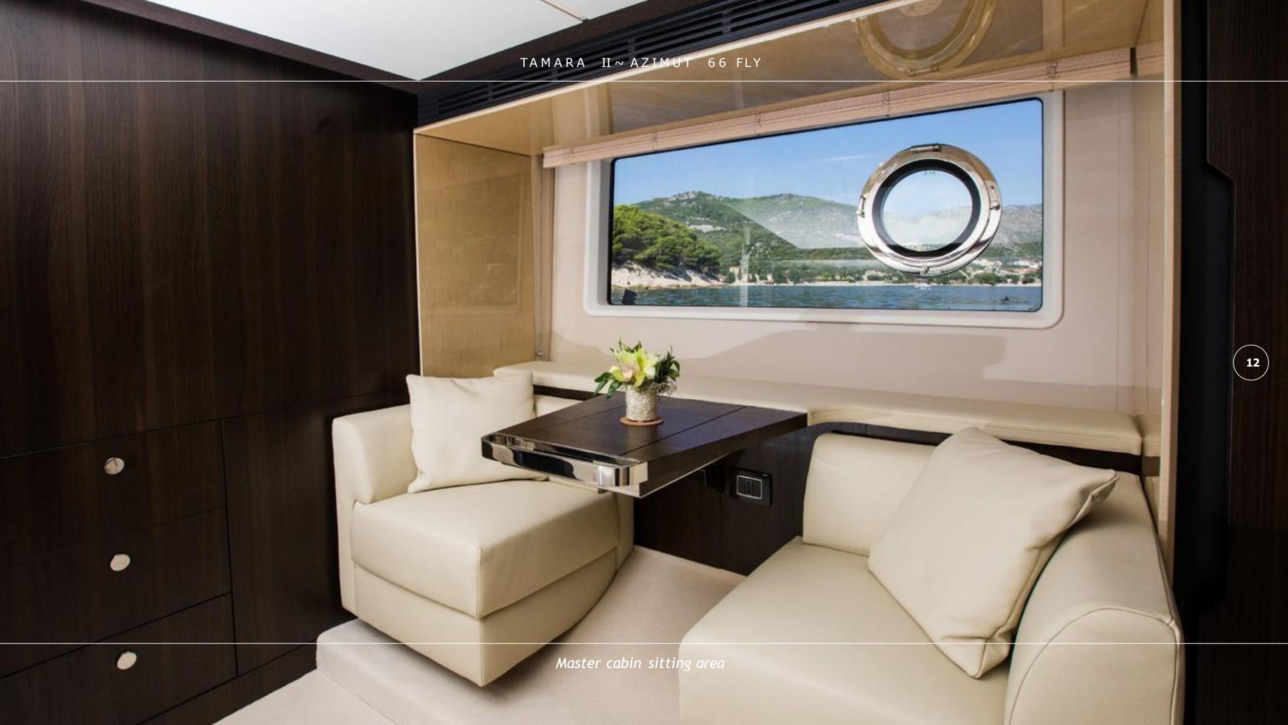
Master cabin sitting area