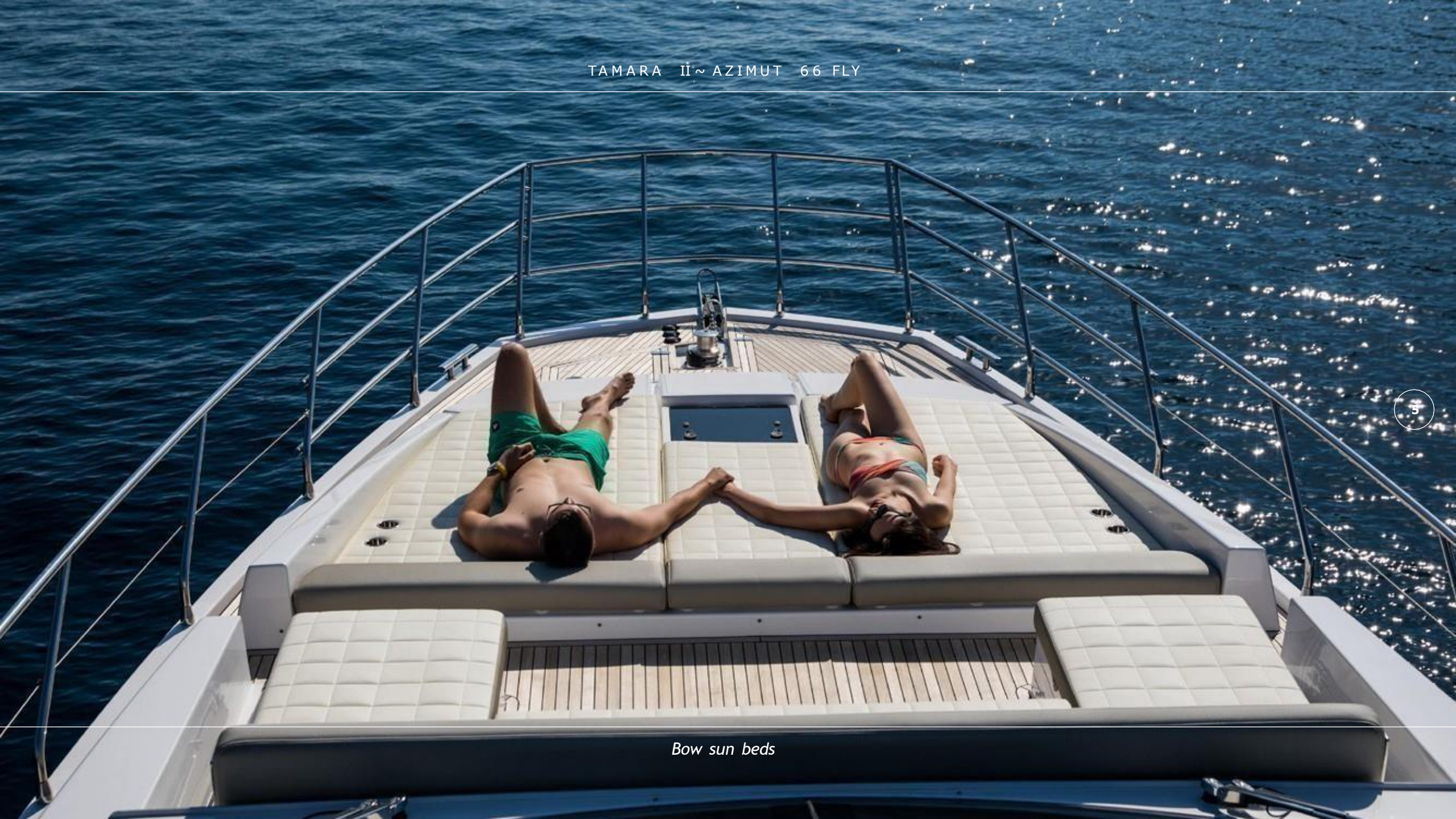
Bow sun beds