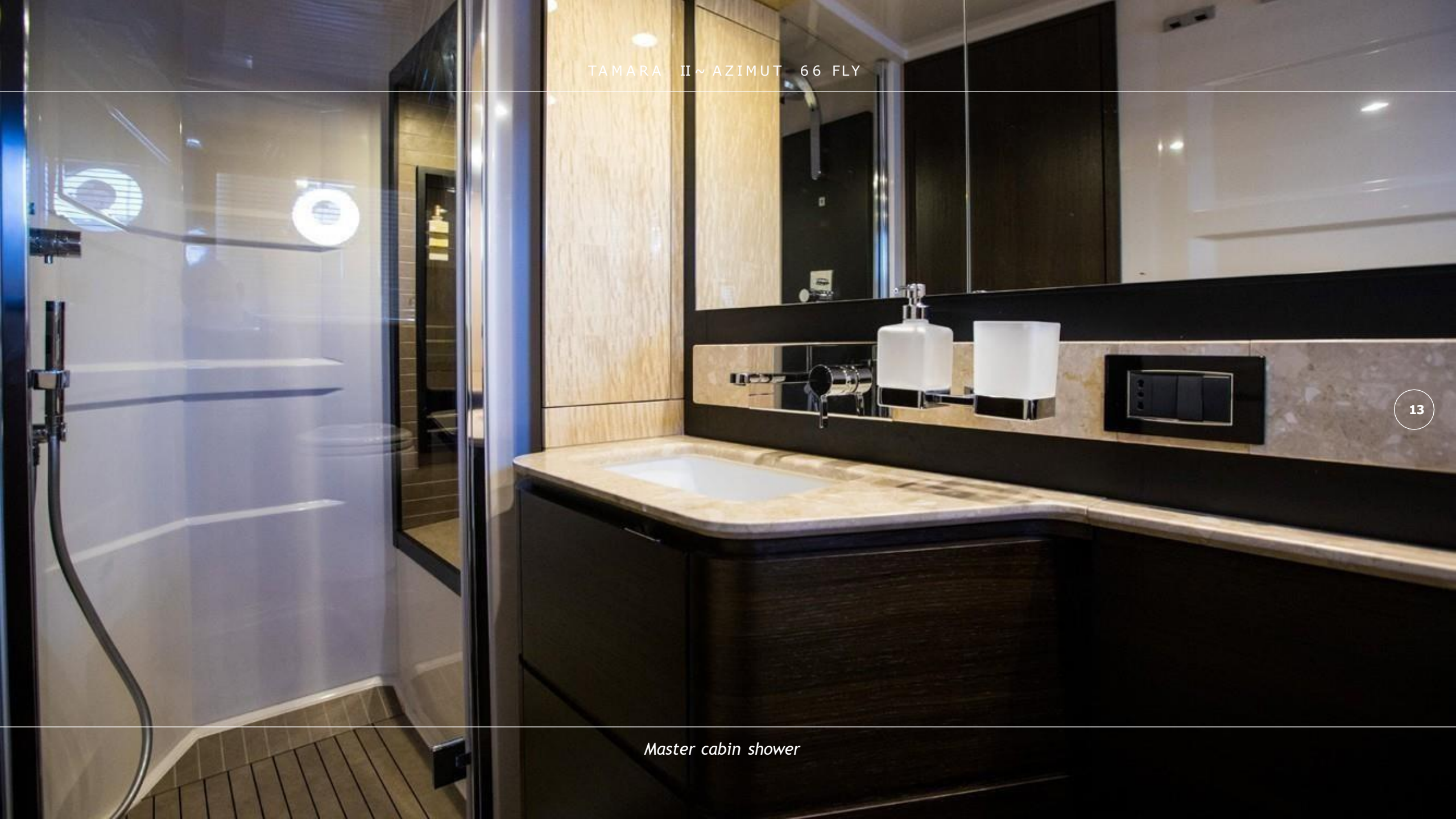
Master cabin shower