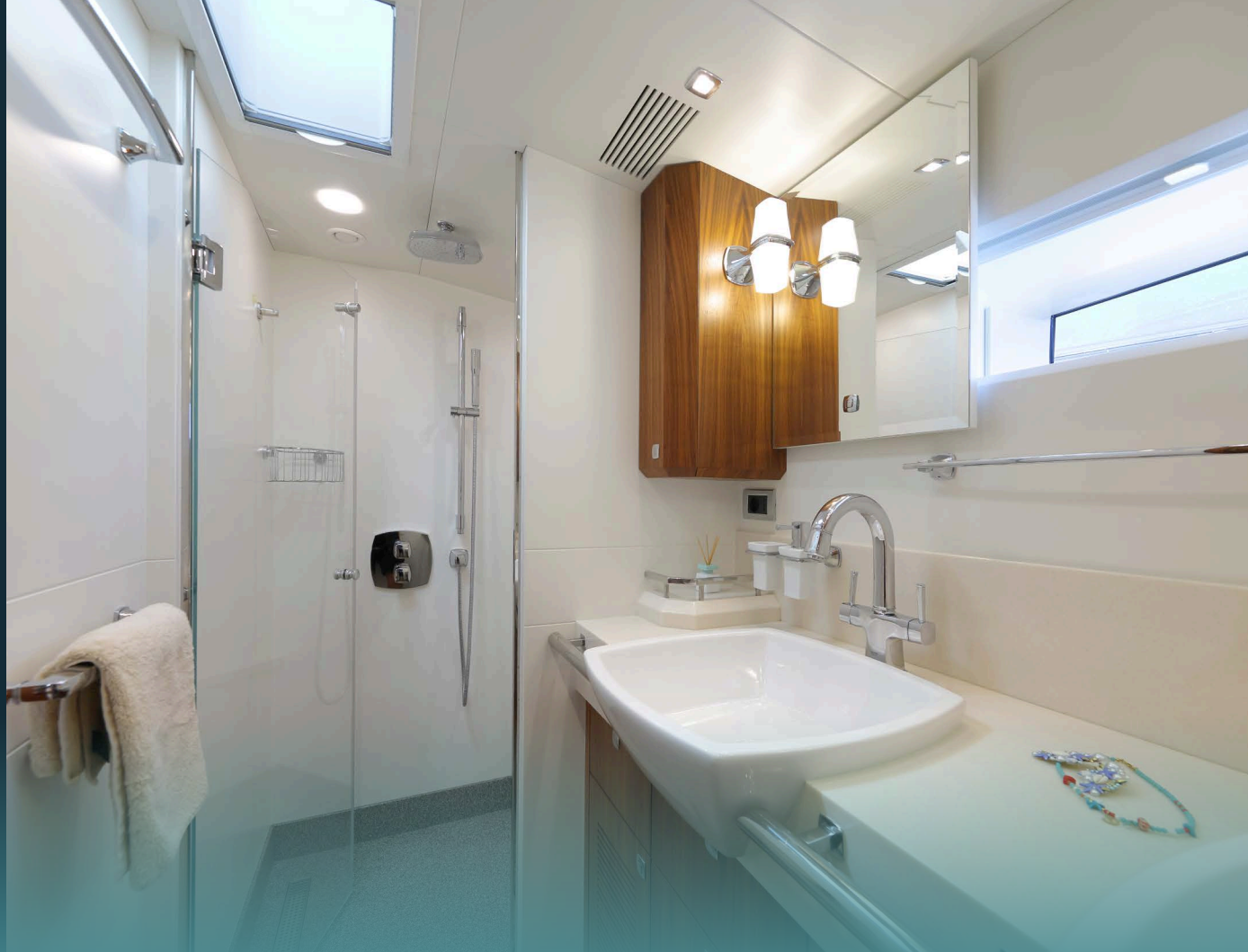
Master cabin bathroom