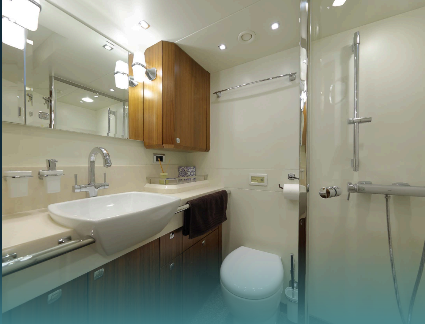
Double cabin bathroom