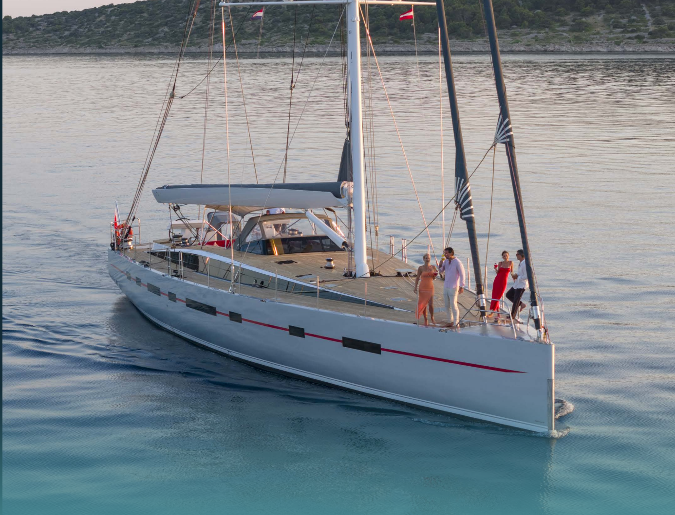
Starboard side view