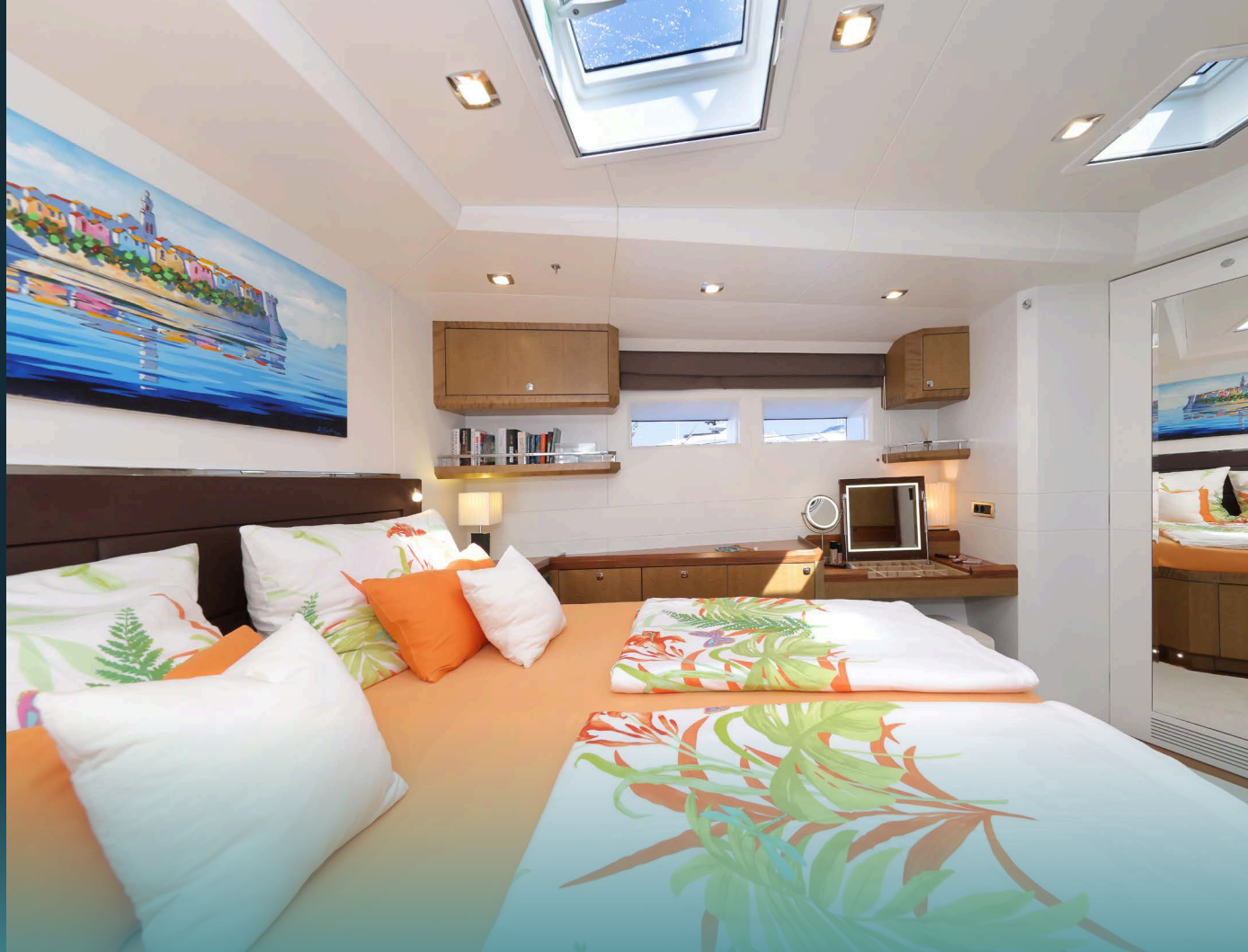
Master cabin side view