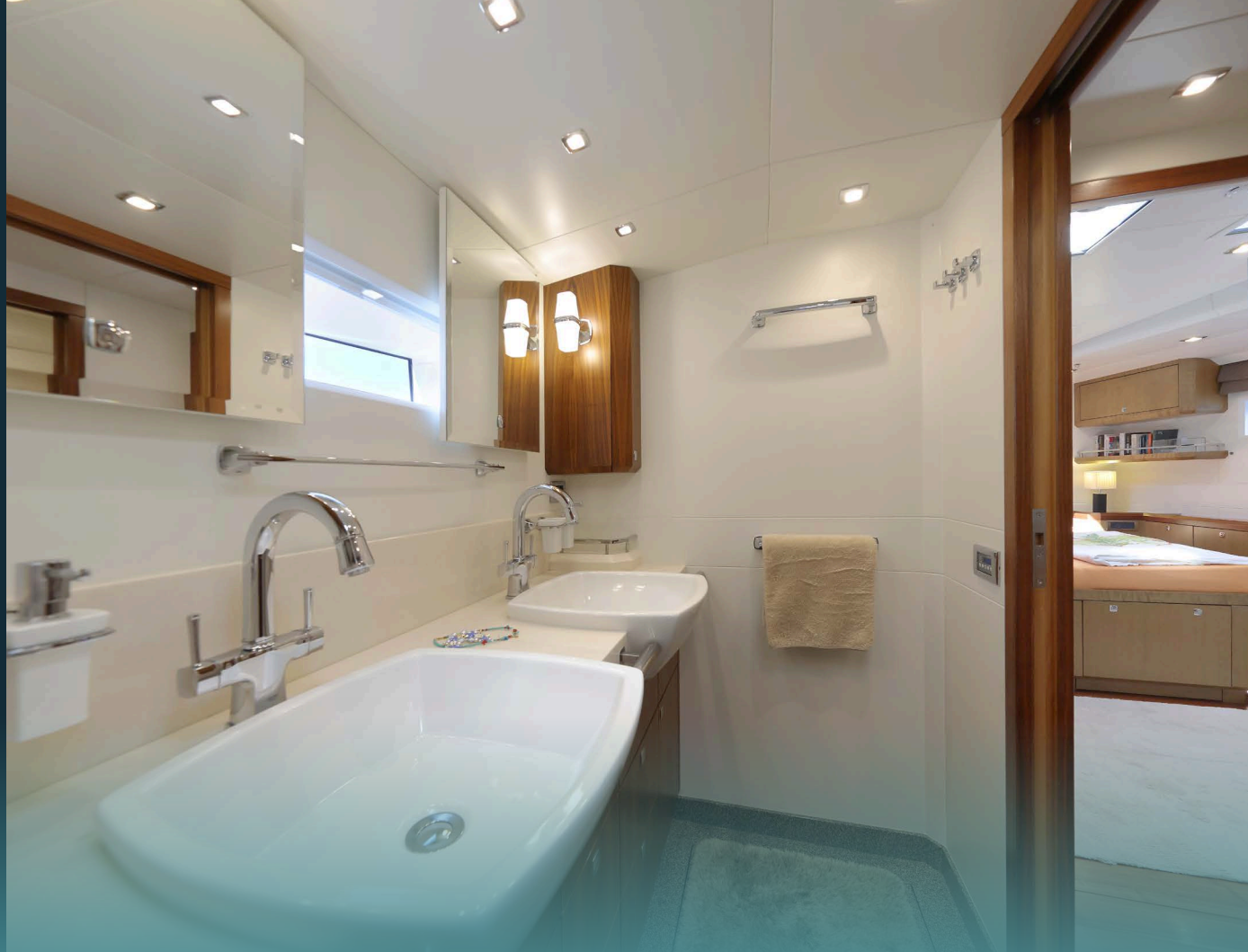
Master cabin bathroom